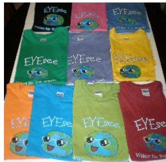
L to R from top: Black, Azalea, Violet, Kelly Green, Iris, Daisy, Tangerine, Sapphire, Kiwi, Cedar

Each shirt is $15 and. Shirts can be purchased by emailing a request to glasses@eyeseemission.org .