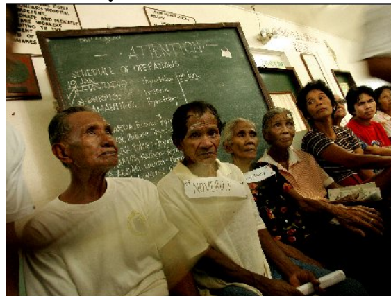
Patients await medical treatment at a clinic run by the healthcare professionals of Physicians for Peace.