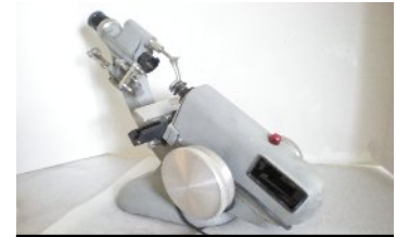
The manual lensometer from EyeCare WeCare Foundation, Inc.